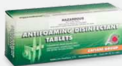
M-140825 Antifoaming Disinfectant Tablets