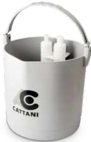
C-040720 Pulse Cleaner Automatic Dispenser