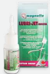
M-040727 Lubri-Jet Lubricant Drops