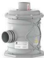
C-160540 HEPA H14 Filter 4-6 Surgeries Housing not included