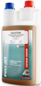
M-060970 Puli-Jet GENTLE Disinfectant Solution