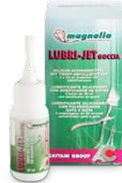
M-040727 Lubri-Jet Lubricant Drops