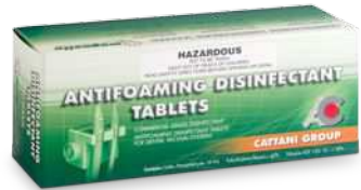
M-140825 Antifoaming Disinfectant Tablets